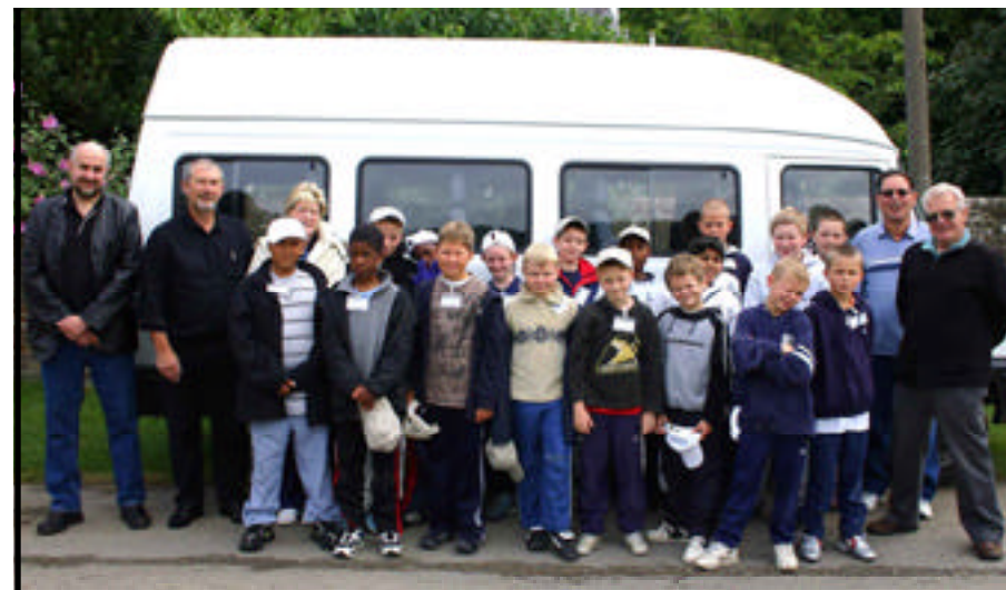
DELL FARM 2005

So, what is the answer? In the shorter term it is logical that an experienced Rotarian stands, preferably a member who has not yet been President and who has, up to now, declined the office but, failing that, a Past President willing to serve again. The rationale behind this is simple - newer Rotarians need the experience and mentoring of the longer standing Rotarians while they take a more active role in the running of the club and, in turn, the longer standing Rotarians need the newer members to safeguard the future of the Club. Make no mistake, time is running out and the next few months will be crucial to the continuance of the Club. So please consider the situation and put your name forward for Vice President 2006/7 as soon as possible.